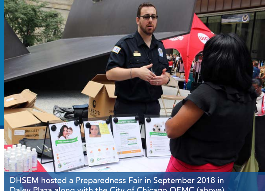
Daley Plaza along with the City of Chicago OEMC (above) and other community partners.

Create safe communities and an equitable and fair justice system for all residents.